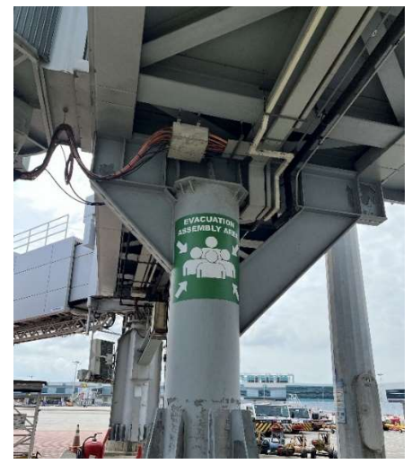
Assembly Area Signage