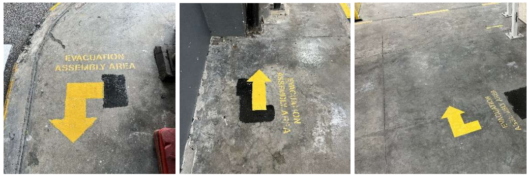
Wayfinding arrows to EAA

Relocation from E1 to E22 and from F30 to F50