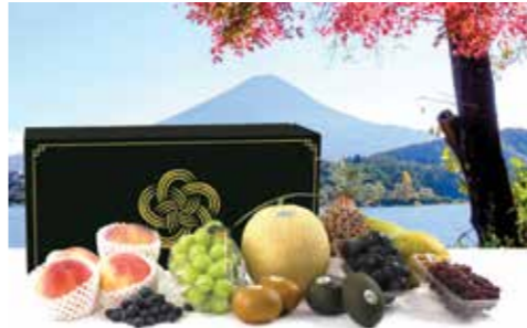
Premium Fruits Gift Box from $68/box from Premium Japan Farmers Market T3