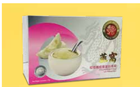
Collagen Bird's Nest with Reduced Sugar (6s x 75g) S$60.50 from Dragon Brand Bird's Nest T3