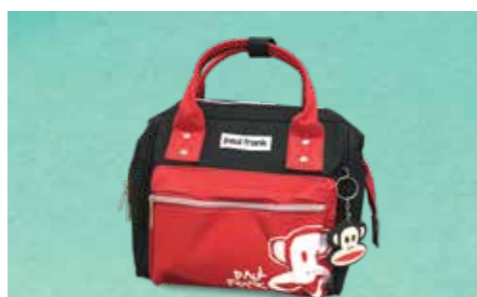
Paul Frank Mini Backpack S$43.00 from The Paul Frank Store T3

All prices are correct at the time of print. Prices are in Singapore Dollar (S$), excluding GST. Items featured are subject to stock availability.