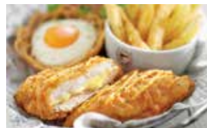
The Manhattan FISH MARKET T1 Level 3

At The Manhattan FISH MARKET, guests are served with lip-smacking American-style seafood, prepared with the freshest catch of the day and done in five different ways – flamed, baked, poached, grilled or fried.