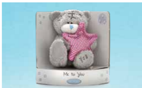
Me to You Bear Holding Shiny Pink Star S$15.90 from Kalms Vending Machine T3