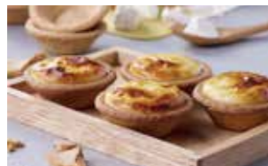
Hokkaido Baked Cheese Tart T3 Basement 2

At The Manhattan FISH MARKET, guests are served with lip-smacking American-style seafood, prepared with the freshest catch of the day and done in five different ways – flamed, baked, poached, grilled or fried.