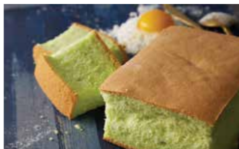
Singapore Pandan Egg Sponge Cake S$11 from Ah Mah Homemade Cake T3