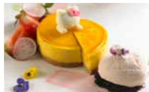
Hello Kitty Orchard Garden T3 Level 1

Enjoy the irresistible taste and unique texture of Hokkaido Baked Cheese Tart's well-loved pastry, made with three different high-quality cheeses and piped into a crunchy, tasty crust.