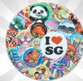
8.5" I Love SG Plate S$16.90 from Discover Singapore