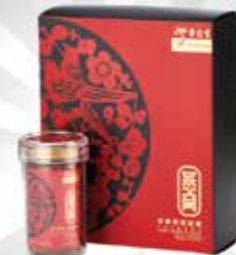
Supreme Ruby Bird's Nest Rock Sugar 150g S$176.64 from Eu Yan Sang