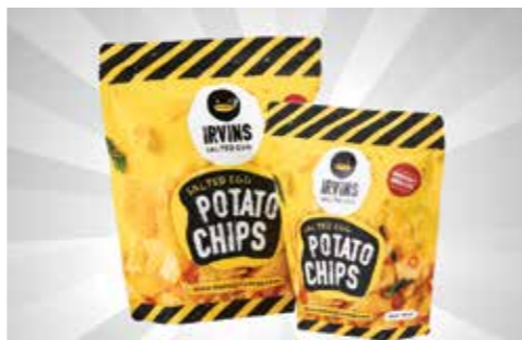
Salted Egg Potato Chips S$15 (big), S$7.50 (small) from IRVINS Salty Egg