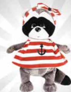
Orange Toy Art Plush Toy S$36.90 from Avenue Kids

All prices are correct at the time of print. Prices are in Singapore Dollar (S$), excluding GST. Items featured are subject to stock availability.