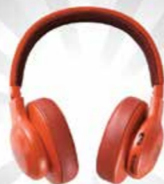
JBL - E Series Wireless On-Ear Headphones S$204 from Cameras Electronics Computers by Sprint-Cass