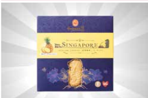
Pineapple Flavoured Cookies S$16.82 from Fragrance Bak Kwa

All prices are correct at the time of print. Prices are in Singapore Dollar (S$), excluding GST. Items featured are subject to stock availability.