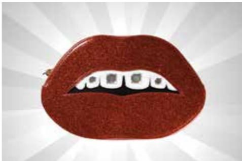
Tatty Devine Dental Bling Makeup Bag S$53.15 from Monoyono