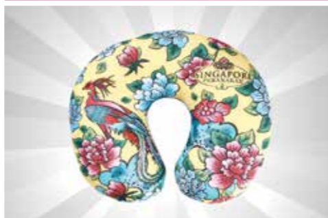
Peranakan Neck Pillow S$19.90 (promo price) from Discover Singapore