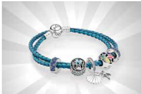
Charmed Bracelet S$517.75 from Pandora