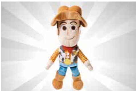
Toy Story Woody Plush Toy S$37.29 from Kaboom