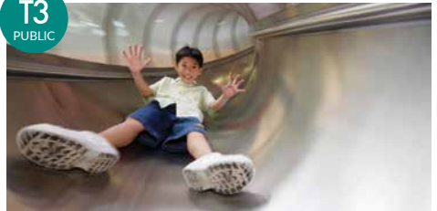
The Slide @ T3