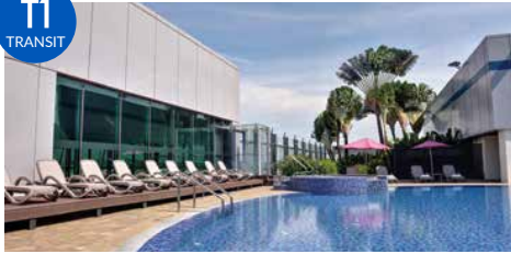
Swimming Pool with Jacuzzi