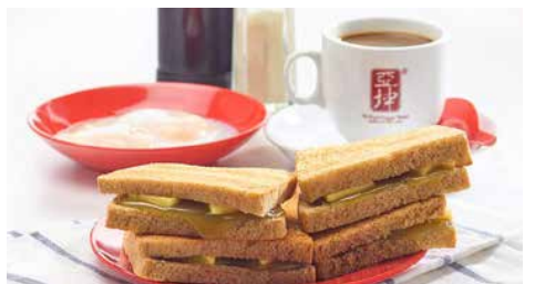
Ya Kun Kaya Toast & Ya Kun Family Café

The famous Michelin recommended Hong Kong brand is finally landing in Changi Airport! Chee Kei is well known for mastering the fine art of wonton noodles and authentic Cantonese comfort food.