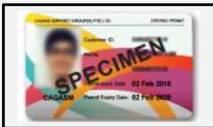
Airfield Driving Permit (Front)