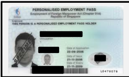
Work Permit (Front)