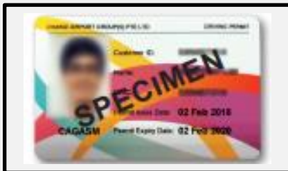
Airfield Driving Permit (Front)