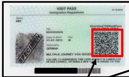
Work Permit (Back)