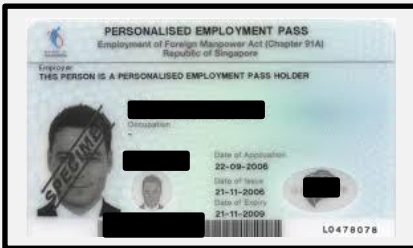
Work Permit (Front)