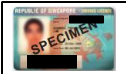
State Driving License (Front)