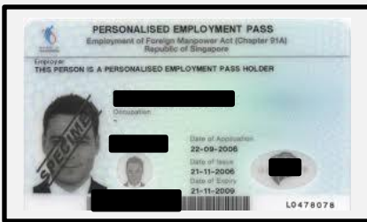
Work Permit (Front)