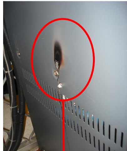
Burnt marks originating from a small fire on the side cabinet of the UPS