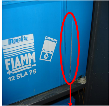
Cracked UPS battery leading to leaking electrolyte