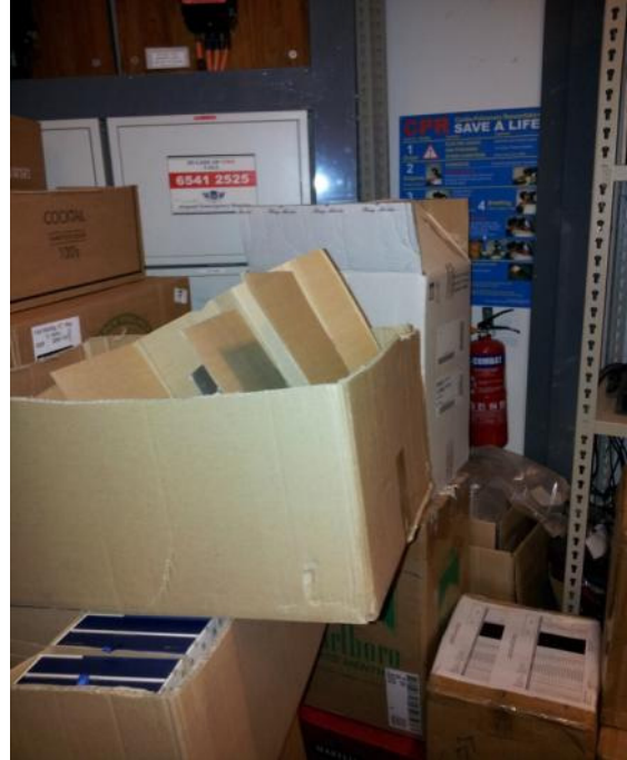
Obstruction to fire extinguisher

Goods placed near MCP may lead to accidental fire alarm activation