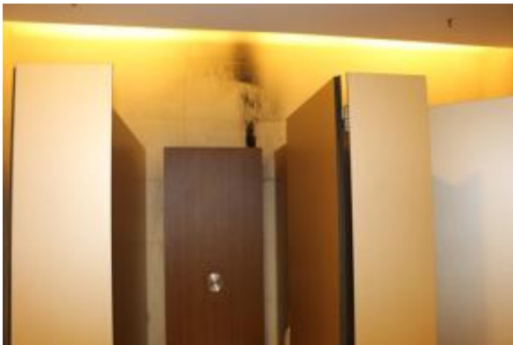
Figure 1 – Front view of affected cubicle