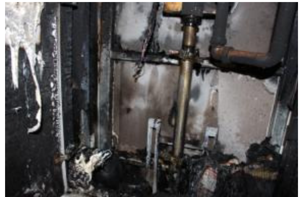
Figure 2 – Burned cabinet within service duct