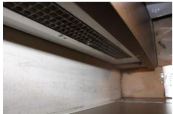
Figure 4 – Front view of vent beside of the toilet bowl where cigarette butts were squeezed through