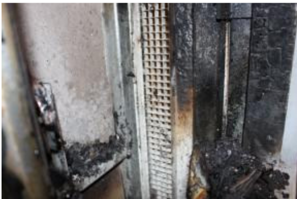
Figure 3 – Vent at the side of the toilet bowl showing cigarette butts being squeezed through