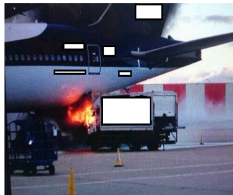
Figure 2 – A cargo carrier burst into flame from an aircraft as it was preparing to takeoff at a busy international airport # .