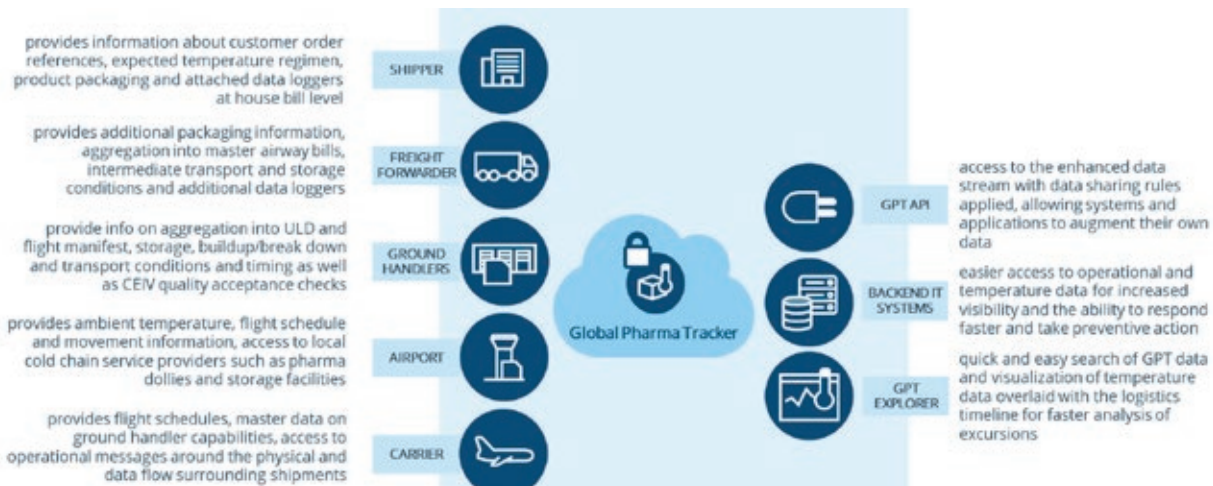
Figure 2: Role of individual parties as data providers to GPT and the types of data output

GPT covers all data which is considered relevant for optimal handling of the shipment, in order to provide a comprehensive single-version-of-the-truth for all parties: