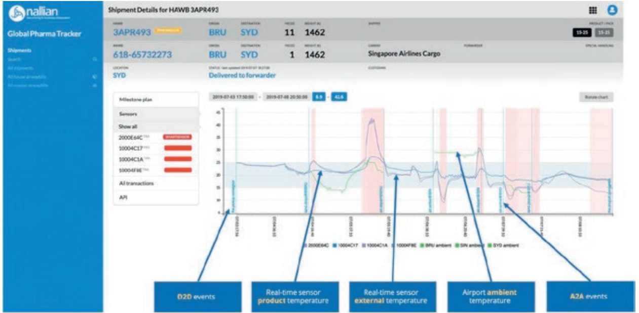
Figure 3: Visualisation of shipment and sub-shipment data

Over time when enhanced with business intelligence tools and machine learning, the platform could lead to a more fine-grained predictive and prescriptive decision-making on a trade lane.