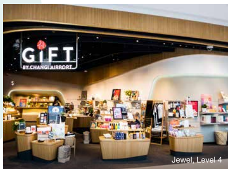
Jewel, Level 4