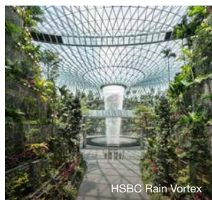
HSBC Rain Vortex

You may just be passing through this tiny island-state, but you can still discover Singapore's sights and sounds, and rich heritage on a Free Singapore Tour. If you have at least 5.5 hours to 24 hours to spare till your connecting flight, join one of our free 2.5-hour guided tours.