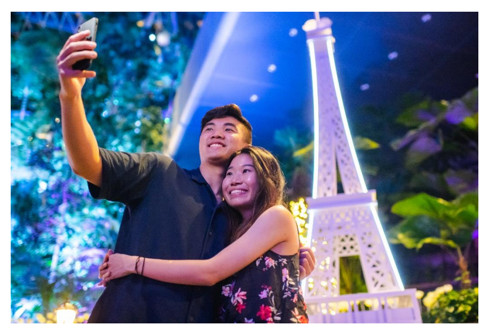
Share a romantic moment at the Eiffel Tower.

Fulfill your wanderlust at Jewel with destination-themed installations featuring iconic global landmarks set against the lush indoor greenery. At the Shiseido Forest Valley, soak in a Japanese onsen, walk down the Great Wall of China, spot the wild animals of South Africa or view the Eiffel Tower up close. Experience these destinations via contactless interactive features and augmented reality on your mobile phones or take photos at these Instagrammable spots. Go 'round the world' and collect stamps on a virtual passport to redeem free Canopy Park access or collect rare stamps to redeem complimentary Canopy Bridge tickets and Jewel retail vouchers. Complete your travel journey at the Canopy Park and be greeted by the Royal Guards of London's Tower Bridge, cosy up to Bali's swing nest, play among the penguins of the Antarctica and say Aloha at Hawaii's Tiki huts.