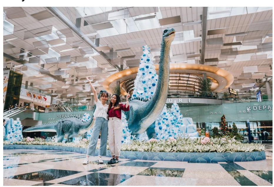
Brave the ice age and capture videos with two colossal moving long-neck Brachiosauruses at Terminal 3's Dino Blitz photospot.

This year's festive centrepiece display takes visitors back to the ice age. Conquer icy snow terrain and be among towering prehistoric creatures at Dino Blitz , which features two larger-than-life moving Brachiosaurus measuring up to 12 metres in length.