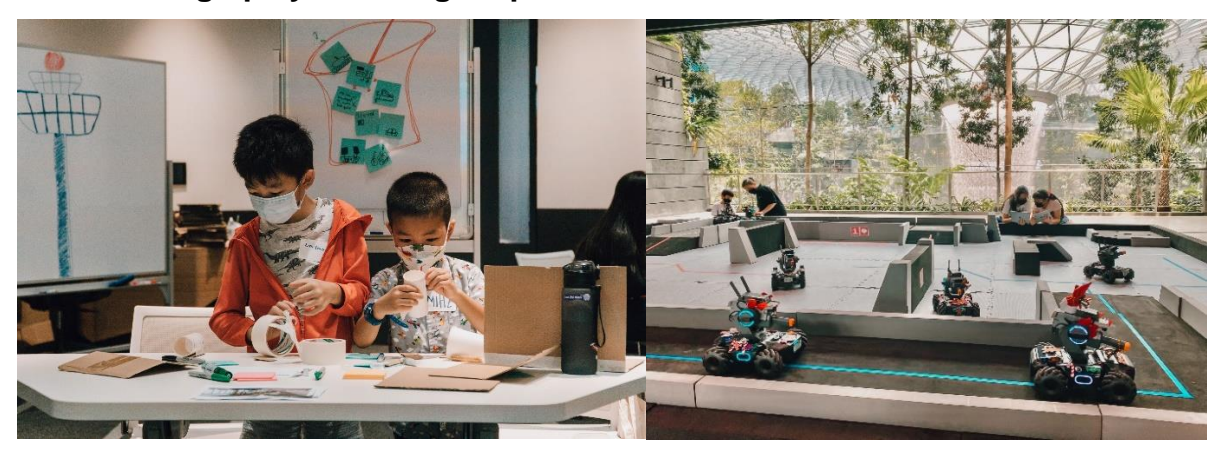
Expand your child's learning through Changi Experience Studio's design thinking workshop.

The sold-out Changi Experience Studio (CES) overnight camp last year is also back by popular demand. Perfect for families looking for a unique bonding and learning experience, the 'A Night at the Airport' 2D1N Family Camp' is packed with fun and educational activities. Enjoy exclusive access to behind-the-scenes airport experiences - the Airport Emergency Service Experience and a tour of the Changi Nursery, which is usually closed to the public. Young minds can also learn the key elements of design thinking and apply their newly acquired creative skills by creating an airport of the future through a kids' Design Thinking workshop! After a fun-filled day, enjoy a magical sleepover in tents within the air-conditioned comfort of the cosy digital attraction.