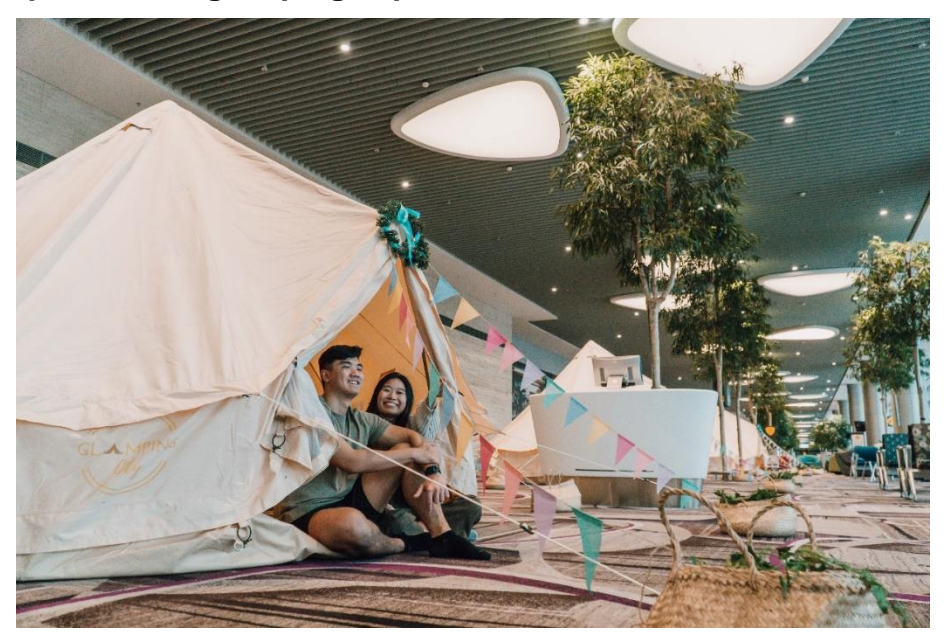
Pack your bags and relive the excitement of travelling with a unique airport transit glamping experience by the runway at Terminal 4.

Planning for a year-end holiday in Singapore? Why not consider a unique airport transit glamping experience in T4?