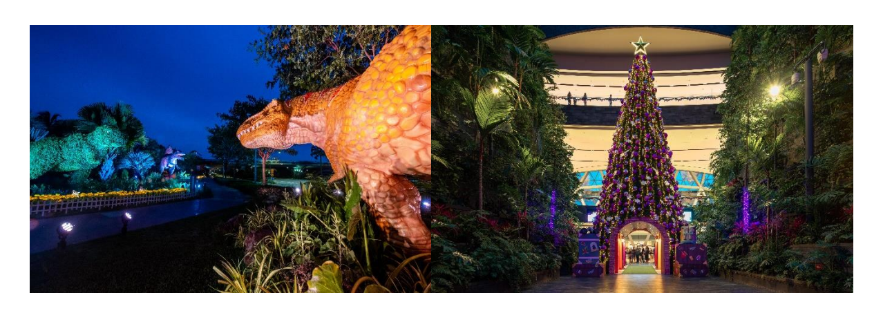
Changi Festive Village ushers in year-end cheer at Changi Airport with life-sized moving dinosaurs, spectacular light-ups, and Jewel's magical 16- metre-tall Christmas tree and snowfall

Exciting line-up of activities include unique airport transit glamping experience, go-karting inside the terminal, carnival with street food and games, stunning photo installations at Jewel, all held with health safety as top of mind