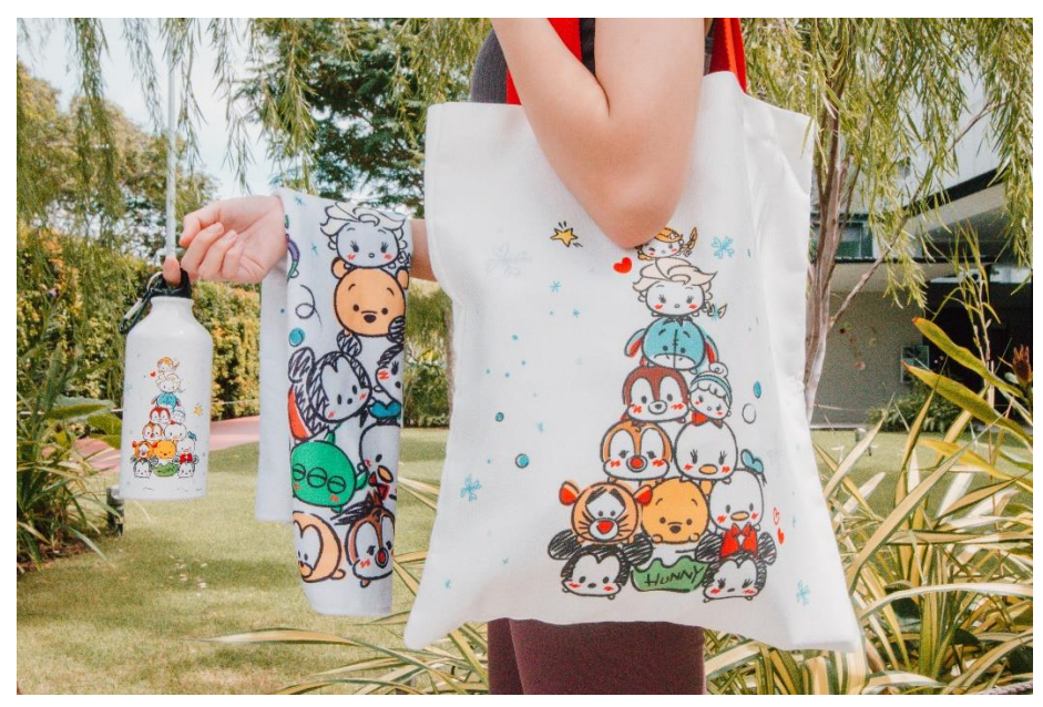
Redeem exclusive Disney Tsum Tsum festive premiums for spends at Changi Airport and Jewel this year-end.

What's the festive season without some Christmas shopping! Bring home exclusive Disney Tsum Tsum premiums, when you shop and dine at Changi and Jewel, from now to 3 January 2022. The festive purchase-with-purchase premiums include tote bag, sports towel, sports water bottle, cooler bag and plush pillow, each available at $8.90 with a minimum spend of $50 at Changi, Jewel, on iShopChangi and Changi Eats. Receive a $5 return voucher, or $8 when you pay with Changi Pay or Mastercard®, for spends in Changi Airport and on iShopChangi. Plus, visitors can redeem 5 hours of free parking² with a minimum spend of $80 in the public areas of Changi Airport or $100 at Jewel.