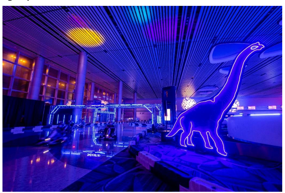
Racer speeding past check-in rows in Terminal 4 Departure Hall at Dino Kart – a dinosaur-themed indoor electric go-kart track with neon lights.

Fasten your seatbelts as the much-loved Dino Kart roars back into action this year. Thrill seekers with a need for speed can zip around Singapore's first indoor, airconditioned go-kart track set up within the Departure Hall, decked out with neon lights and a dinosaur theme, at speeds up to 24km/h. Covering a distance of 400 metres, the track manoveurs past a total of 10 turns and bends in between the check-in rows! Another popular activity, Dino Bounce bouncy castle , will also return for a second run.