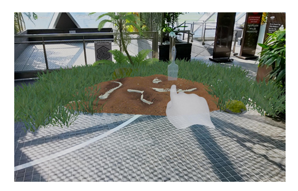
Mini game 1 - Be an archaeologist for a day as you brush off fossil bones and guess which dinosaur they belong to!