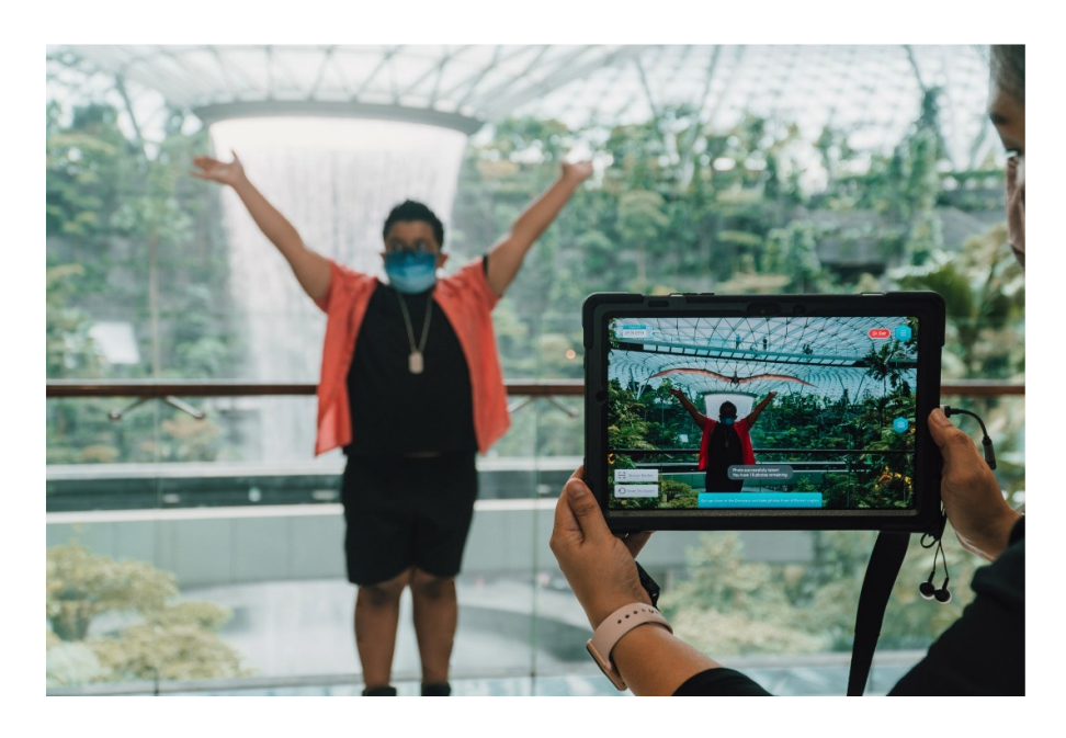
Mini game 3 - As you conclude your quest, have your picture taken with the main dinosaur casts. Track each of these eight prehistoric pals as they have found their own sweet spots all around Jewel for that photo moment with you! Head to Level 2 to meet with the T-Rex, or search for the towering Brachiosaurus among the bamboo poles. Create insta-worthy poses with these 3D dinosaurs in AR and have fun snapping shots to capture those moments to share with friends and family