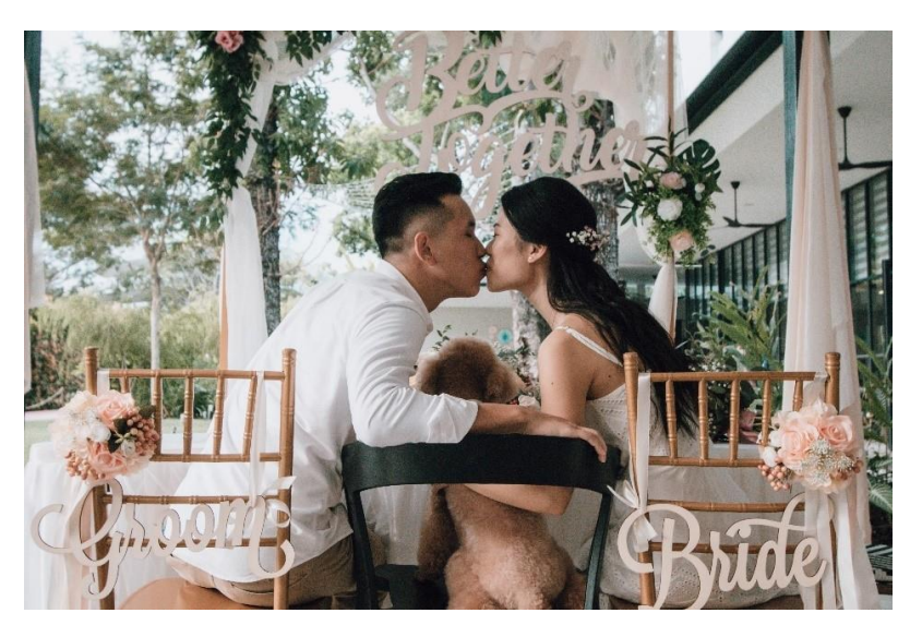
March in and celebrate your special moments with your fur-kids at the pet-friendly Hub & Spoke.

Couples can choose between a menu of canapes or a full course Western set, specially prepared by Hub & Spoke café. Design an exclusive canapes menu based on your preferences, choosing from a unique selection of local delights such as nasi lemak and laksa, and western classics such as burger sliders and garlic wings. For couples who prefer the full course set, look forward to popular favourites being served such as cream of mushroom, chargrilled salmon and yummy desserts. Halal options are also available and prepared in a separate kitchen, so you can rest assured all your guests are well taken care of. Each menu package includes beverages, venue sound system and complimentary parking.