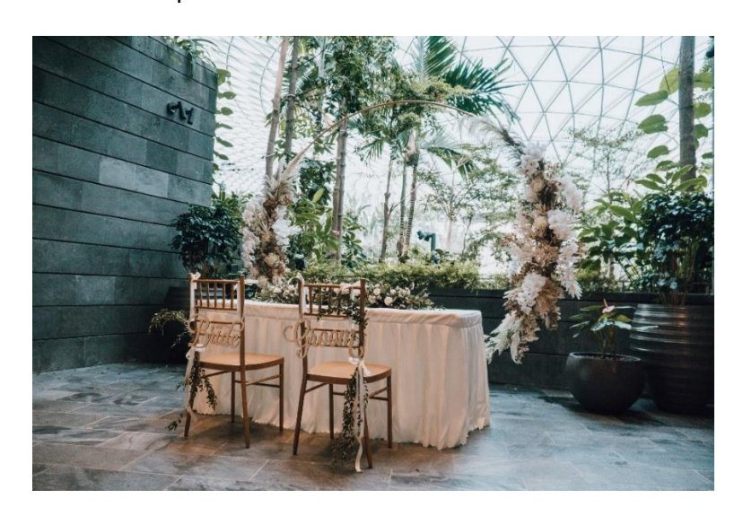
Idyllic views of the valley's lush greenery from the balcony of Valley View Private Suite elevate the touch of romance.

available for pre-and-post event use, such as for a tea ceremony, fun entourage party, or simply as a haven for the couple to rest.