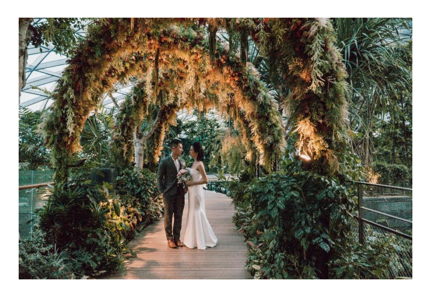
Say your I do's under the Instagrammable flower arch at Canopy Park.

Across the different venues available, wedding couples and their guests can enjoy lush nature in air-conditioned comfort amid the architecture wonders of Jewel. For those who seek exclusivity and intimacy, hold a private solemnisation ceremony with their closest loved ones at the elegant Valley View Private Suite (Level 4) which boasts an exclusive balcony offering a mesmerising view of the Shiseido Forest Valley. Romantic floral decorations complete the ethereal indoor garden scene, which looks straight out of a fairy tale. A cosy reception can also be held within the luxurious comfort of the premium suite.