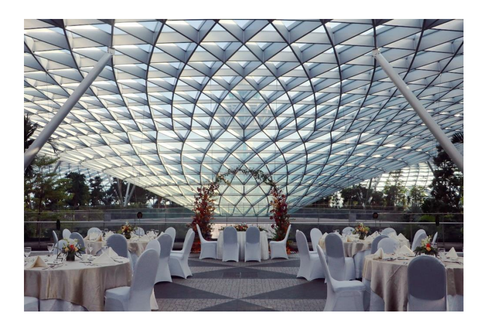
Guests can enjoy the cool setting, natural lighting and greenery in a banquet setting at Cloud9 Piazza.