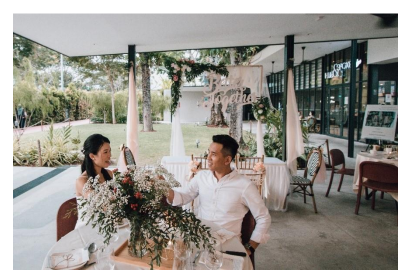
The fun and casual vibe at Hub & Spoke is perfect for couples looking for a unique outdoor wedding venue.

Couples can choose between a menu of canapes or a full course Western set, specially prepared by Hub & Spoke café. Design an exclusive canapes menu based on your preferences, choosing from a unique selection of local delights such as nasi lemak and laksa, and western classics such as burger sliders and garlic wings. For couples who prefer the full course set, look forward to popular favourites being served such as cream of mushroom, chargrilled salmon and yummy desserts. Halal options are also available and prepared in a separate kitchen, so you can rest assured all your guests are well taken care of. Each menu package includes beverages, venue sound system and complimentary parking.