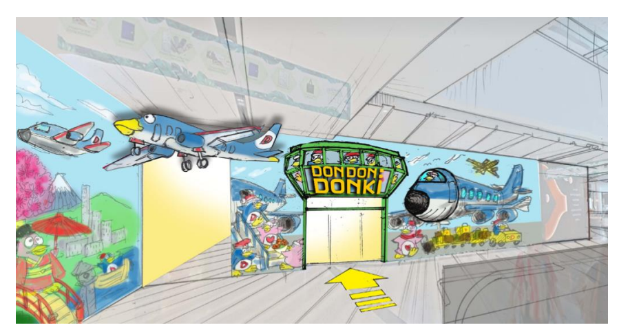
Reference image for Jewel's DON DON DONKI store

SINGAPORE, 11 January 2022 – DON DON DONKI and Jewel Changi Airport Devt. today announced plans for the Japanese lifestyle brand to open a store in the Eastern part of Singapore at Jewel Changi Airport (Jewel). Slated to be one of the brand's largest outlets in Singapore, the store at Jewel spanning 18,000 sqft will be located at Basement One. It is expected to open its doors in the first quarter of 2023 and will add to Jewel's multi-faceted suite of lifestyle offerings.