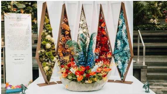
Floral display by Berlinda Tan: “Resonance of the Past: A Contemporary Symphony of Singapore’s Legacy” features the former National Theatre of Singapore with its iconic diamond-shaped façade and crescent-shaped bowl fountain.