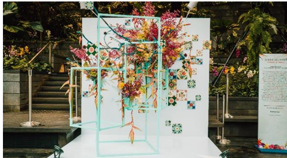
Floral Display by Evelyn Lee: “Graceful Beauties: The Allure of Orchids” adopts the use of an Ikebana arrangement that is a fusion of orchids and peranakan styles.

Putting the spotlight on local florists, visitors can see original floral installations from the renowned floral designers including Anson Low (AIFD 1 , CFD 2 ), Christopher Lim (AFID, CFD, Riji), Damien Koh (PFCI 3 , AIFD, CFD) and more. A total of 10 artworks (each measuring 1.5 metres in width and height), inspired by different facets of Singapore such as its history, culture, food and national flower, are displayed at the Shiseido Forest Valley and Canopy Park.